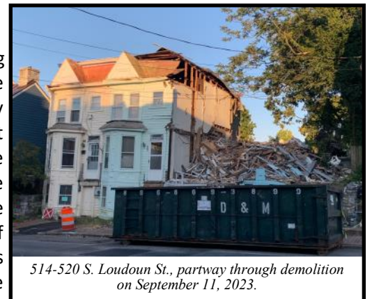
514-520 S. Loudoun St., partway through demolition on September 11, 2023.