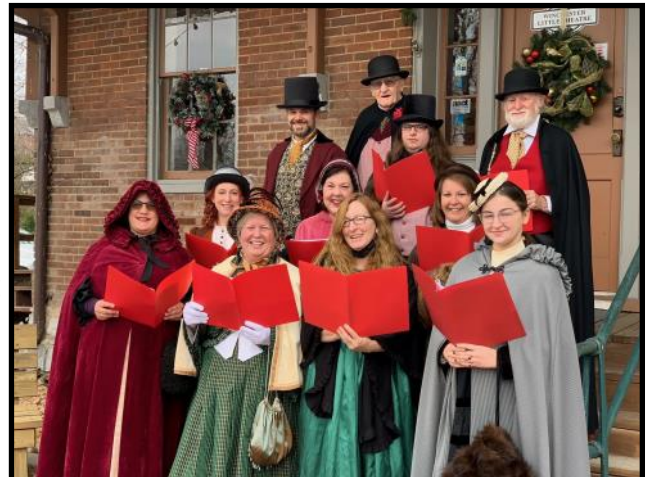
WLT carolers returned to the House Tour to brighten the event with their beautiful caroling and costumes.

We had to drastically scale back the shop for 2021 due to a number of