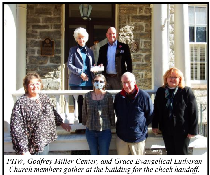
PHW, Godfrey Miller Center, and Grace Evangelical Lutheran Church members gather at the building for the check handoff.

You can make a pledge directly through the