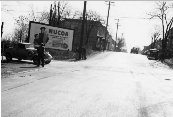
This 1930s photograph, taken at the corner of Kent and Cork Streets, uncovered the original porch configuration.