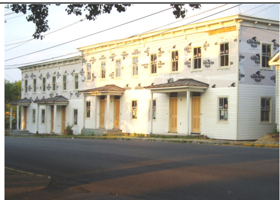
An in-progress glimpse of the South Kent Street townhomes.

Completion of the seven townhomes is slated for the end of September, while completion of the other single family homes will follow next year. Additionally, KSR, LLC is looking forward to working with PHW, Inc. on the revitalization of several of these additional properties which bear PHW restrictive covenants. ♦