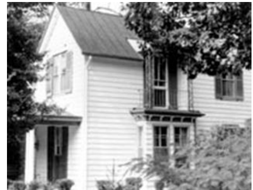
Before and after siding changes.