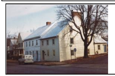
422 and 424 S. Loudoun St. during rehabilitation, date given as 1981.