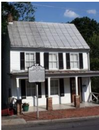
The Patsy Cline House, 608 S. Kent St.

Celebrating Patsy Cline completed a major milestone in their vision of keeping Patsy Cline's legacy alive in her hometown. Patsy Cline's home at 608 South Kent Street opened as a house museum on August 2 after a multiple-year fundraiser and renovation project. Now tourists can enjoy the fruits of CPC's labors with docent-guided tours of the home where Patsy Cline lived at the start of her musical career.