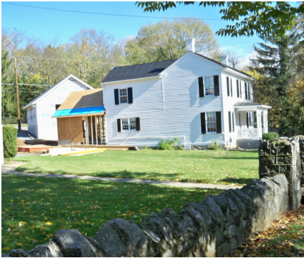
... during the framing...