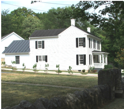
and the completed structure. ♦