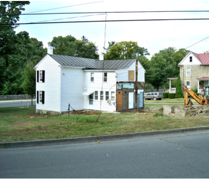
804 Amherst during the initial site work ...