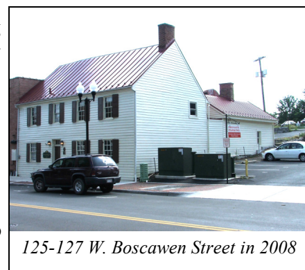
125-127 W. Boscawen Street in 2008