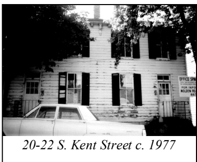
20-22 S. Kent Street c. 1977

The next three buildings purchased by the PHW Revolving Fund were the first to venture away from PHW's initial target area of South Loudoun Street. They were also some of the first properties bought with a commercial use in mind instead of a residential use. The Grant Properties at 20-22 and 24 South Kent Street were the first of many buildings PHW's Revolving Fund purchased on South Kent Street.