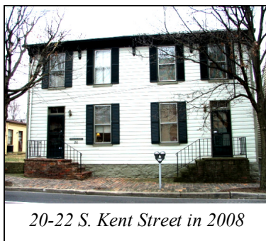
20-22 S. Kent Street in 2008