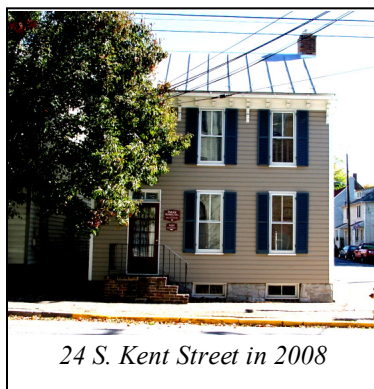
24 S. Kent Street in 2008