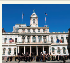
New York City Hall