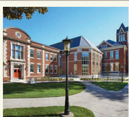
University of Missouri